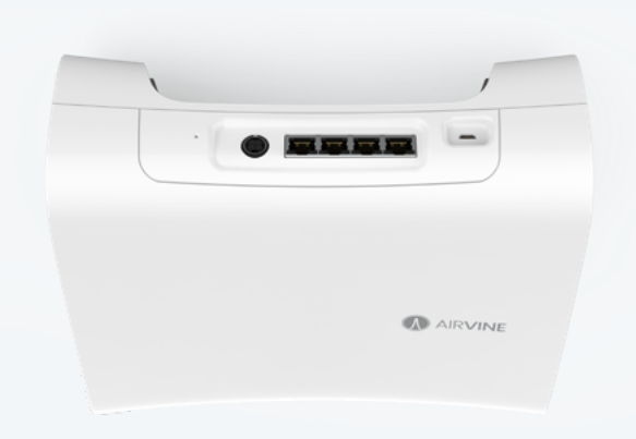
WaveTunnel<sup>™</sup> by Airvine

Airvine offers an alternative with its wireless Ethernet backhaul portfolio, specifically designed to address the needs of large public venues. Comprised of two platforms, the WaveTunnel which can cover distances up to 150m and penetrate most interior walls, and the WaveCore which is designed to blast through concrete and brick, Airvine offers complete backbone connectivity in any building, any floor plan, anywhere.