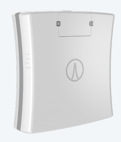
WaveCore<sup>™</sup> by Airvine

With the ability to blast through any wall or floor, concrete or sheetrock, these solutions provide multigigabit connectivity that can be quickly deployed and easily reconfigured, allowing venues to support a wide array of digital services without the hassle of re-running cables or extensive downtime.